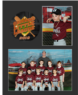
Traditional Folder Style Memory Mate