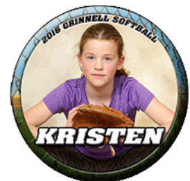
3 1/2" Personalized Photo Button